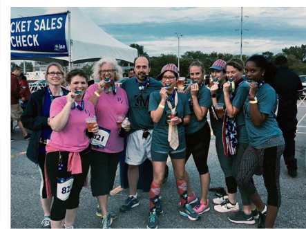
Team G&M were #patriotic at the J&A Racing Corporate 5K in May! We joined Team Parks Zeigler to bite the metal!