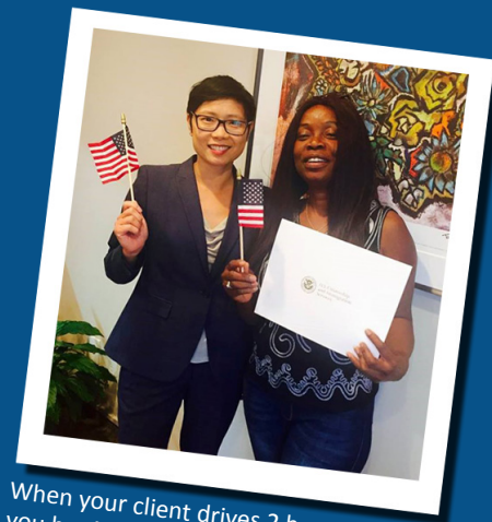
When your client drives 2 hours to show you her Naturalization Certificate and personally thanks you.